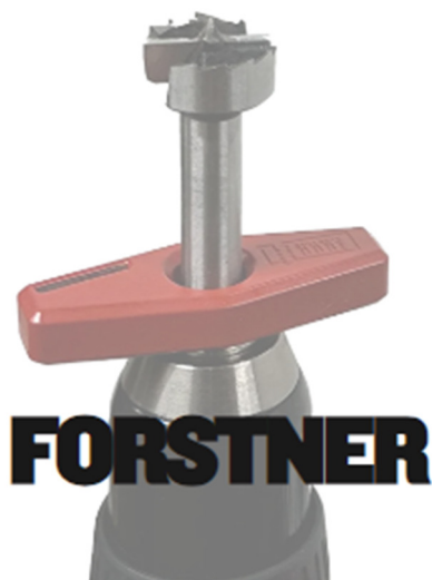
Bullseye10 Forstner bit with device