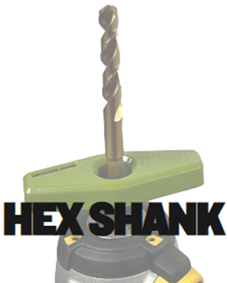
Bullseye15 Hex Shank bit with device