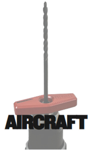
Bullseye14 Aircraft Bit with Device