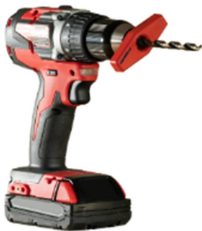
Bullseye4 Red Drill and Red Device