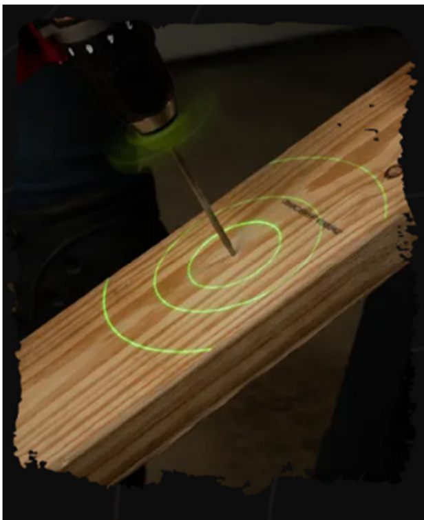
Bullseye3 Angle Board Laser Image